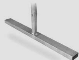
Heavy Duty Feet