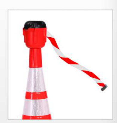
Brake: For slow, safe belt retraction